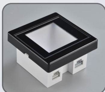
Ethernet 6 Pin Port